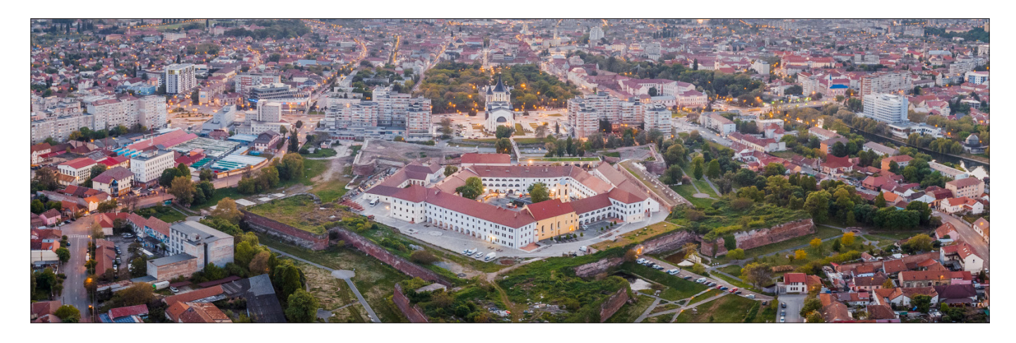
Oradea Castle, a fortress in the style of the Italian Renaissance, was the venue for 'Cities of Tomorrow'.

The dozen is full: the annual 'Cities of Tomorrow' conference was held in Romania for the 12th time. And for the first time it took place not in Bucharest, but in Oradea.