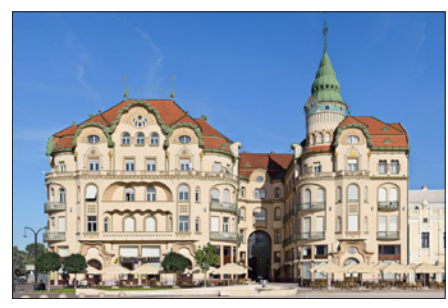
Oradea is Romania's centre of Art Nouveau.

So after the twelfth 'Cities of Tomorrow' conference, which was the first to be organised regionally far away from the capital, the result was doubly positive. On the one hand, the supportive involvement of the city and county as well as Visit Oradea aroused interest in the internationally lesser-known city of Oradea and the surrounding Bihor County, but also in Romania's diversity beyond Bucharest in general.