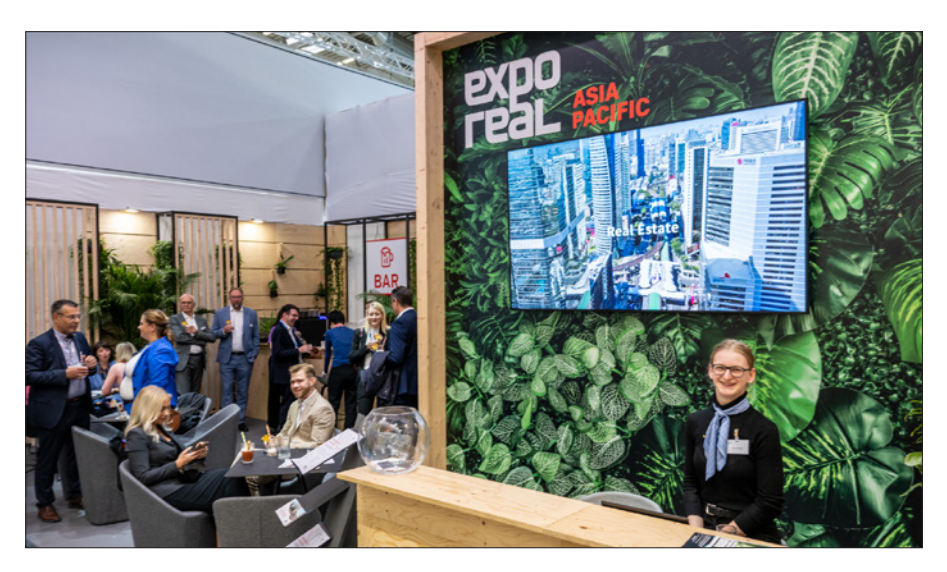
Asia Pacific is increasingly attracting the interest of the European property industry.

sion funds expressed a certain reluctance to invest in property as an asset class, but on the other hand, there was also stated that the proportion of property in the portfolio should be increased because it is too low.