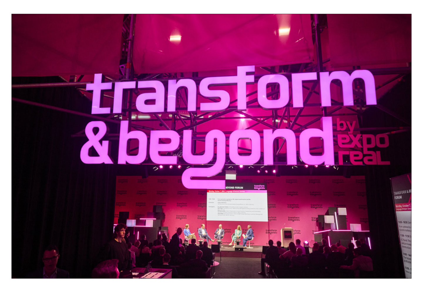
'Transform & beyond' was not just an exhibition area in its own right; the topics are of general interest to the real estate sector.

More than 40,000 participants from 75 countries and 1,778 exhibitors from 34 countries attended this year's Expo Real from 7 to 9 October. This once again demonstrated the great importance of the International Trade Fair for Property and Investment.