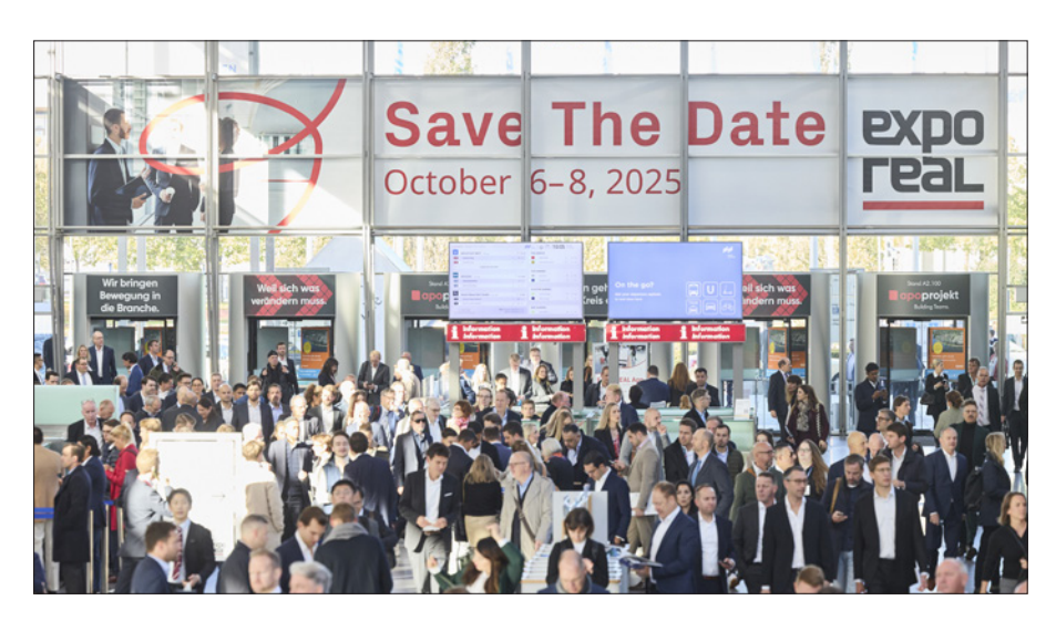
The date for Expo Real 2025 has already been set.

But before that, the next Expo Real will take place in Munich. The dates have been set for Monday 6 October to Wednesday 8 October 2025.